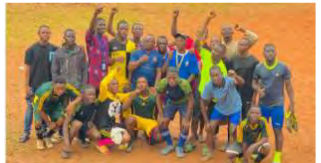
Nulass Lasued and Nulass Lasustech