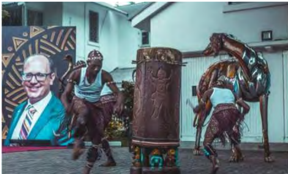
Badagry Cultural Group

Badagry traditional and cultural troupe comprising of the Ajara Vetho Sato Drummers and the Gogoke Troupe from Igbogbele Badagry West showcased the peculiarity of their content to the world during a reception hosted by the United States Consulate in honour of 16th edition of the Headies Award held at the US Consulate, Lagos recently as part of the programmes lined up for the main event to be announced by the organisers soon.