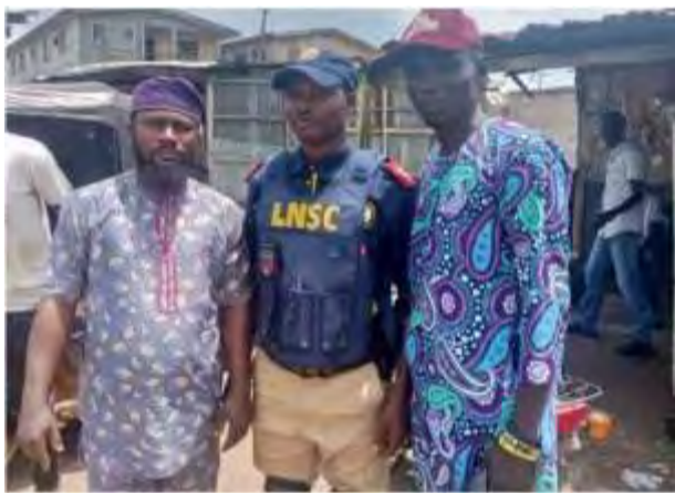
Youths with new LNSC commander

Youths in Agbado Oke-Odo Local Council Development Area (LCDA) have declared their support to work with the Lagos Neighborhood Safety Corps (LNSC) to tackle insecurity in the