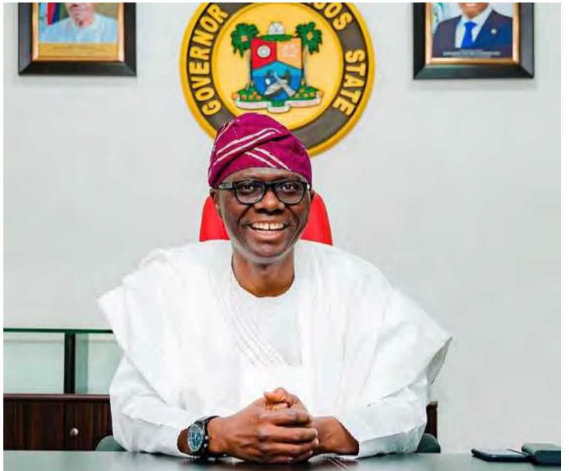
Mr. Babajide Sanwo-Olu