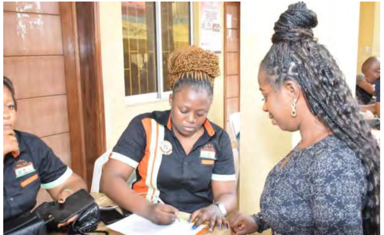
Justice Ministry officers offering legal counsel to Iba resident