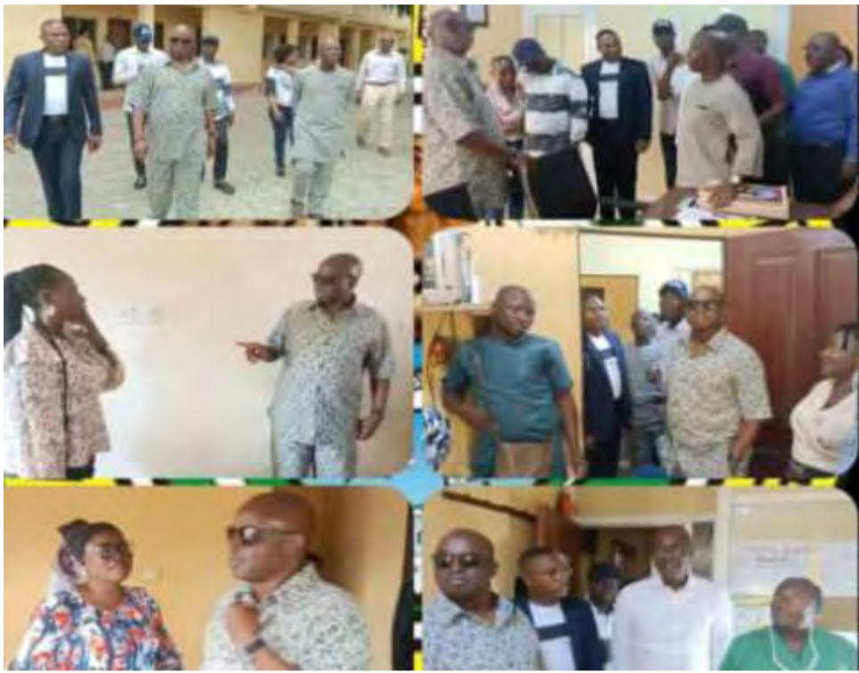
Iba LCDA staff Check-up