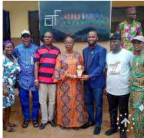
NGO" project commissioning

He appealed to the residents to make good use of the facilities, adding that they should expect more