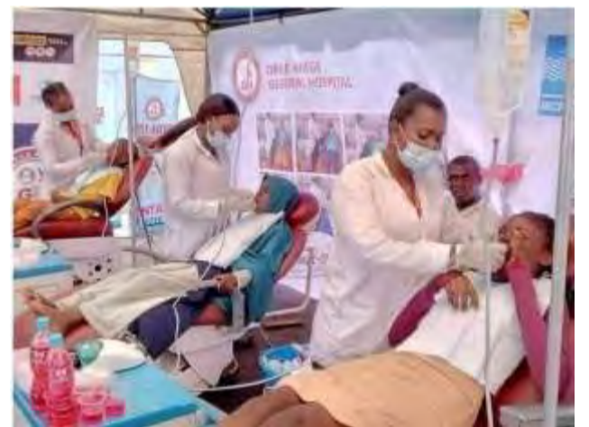
Kids health check-up for resumption

In a bid to ensure children are medically fit for the 2023/2024 Academic session, Orile Agege General Hospital has organised its second annual edition of the school health outreach programme tagged "Back to School: Resume Healthy".