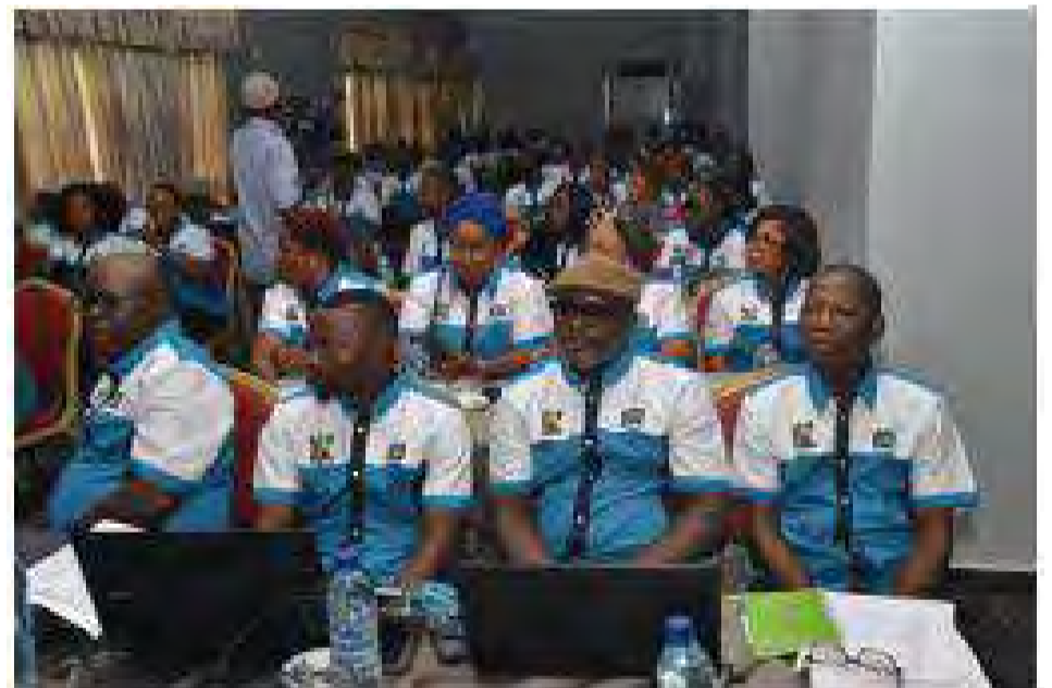
Procurement officers at a training

He, therefore, enjoined Procurement Officers in the State to brace up and rededicate themselves to duty and provide the required support to the State Government to facilitate more effective and efficient service delivery to residents of the State.