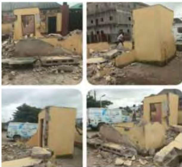
The demolished Iba LCDA security post

After being abandoned for a long time, the old security post of Iba Local Council Development Area (LCDA) has been marked for renovation as the site has been demolished to be reconstructed.